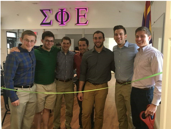
The Grand Re-Opening of the Extension