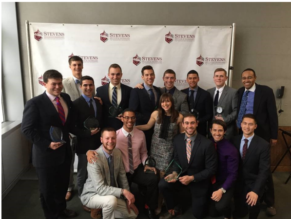
Group Photo from the Student Leadership Awards Brunch (Winning 9 Total Awards)