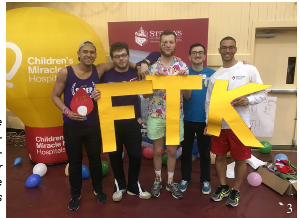
The Brothers who Made it all 12 hours of Stevens-THON, a Dance Marathon to Raise Money for the Children's Miracle Network Hospitals