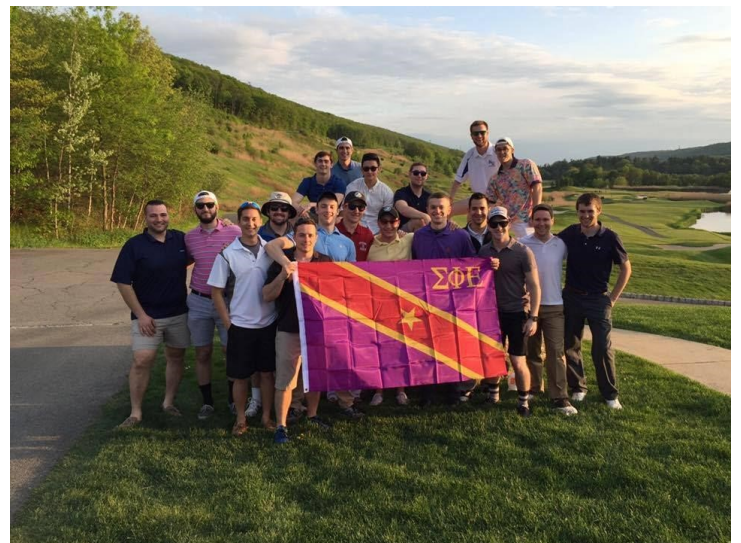
Brothers participating in the summer golf outing