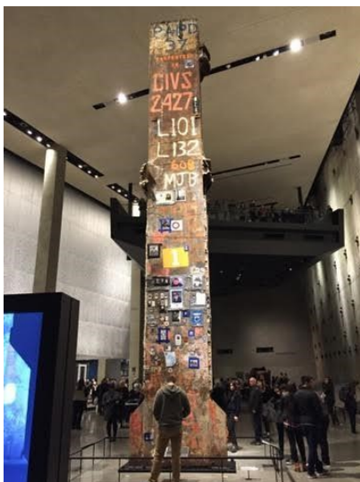
Dan Fenton in front of the last steel beam removed from Ground Zero