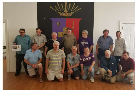
Pictured above: Members of the Class of 1977

We at New Jersey Alpha would like to thank all of the alumni who were able to visit the chapter house for a reunion this past month. We hope that all who visited are pleased with how our chapter has grown over this decade, especially those who graduated 50 years ago!