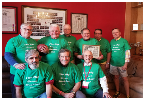
Pictured above: Members of the Class of 1967

If a reunion interests you, please consider contacting us to arrange a day where you can visit. We are always interested in meeting the men who shaped this fraternity into what it is today. Also, don't forget Founder's Day is November 4th this year. We're looking forward to spending the day reconnecting with our alumni over football and a cook-out.