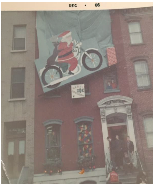
530 Court Street, December 1966